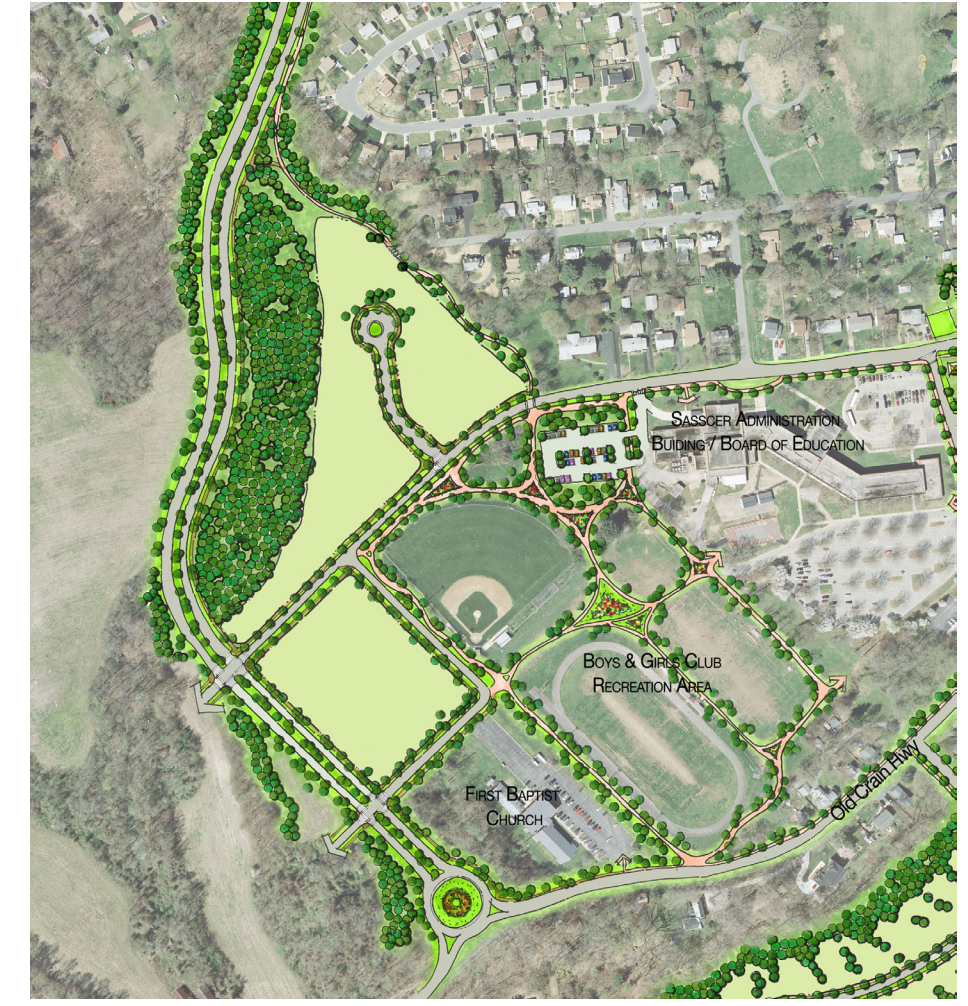
Map 7: Boys and Girls Club Park and Trail Improvements

As described earlier, recreational opportunities should be expanded to the western side of the town to take advantage of the natural assets of the community. The proposed trail system should provide a loop around Depot Pond and connect with the new community center.