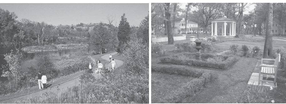
Example of Comparable Trail System