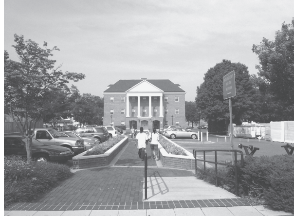
Quality Pedestrian Linkage