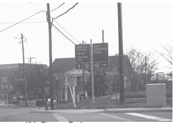
Incompatible Signage Systems