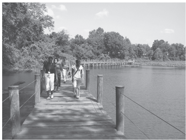
Boardwalk and Trail System