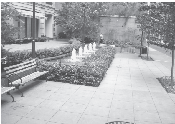
Comparable Public Open Space and Plaza

Western Branch and Depot Pond present recreational opportunities in close proximity to the town. Currently, an informal parking lot along Main Street/MD 725 provides access to the eastern portion of Western Branch where people fish. Offering access to both bodies of water and developing a trail system that links Depot Pond, Western Branch, the new Schoolhouse Pond community center, and the town core could create the community's prime outdoor recreational outlet. Two organized trailhead parking facilities, one on the site of the existing informal parking along Main Street and a second one at the Old Port site west of