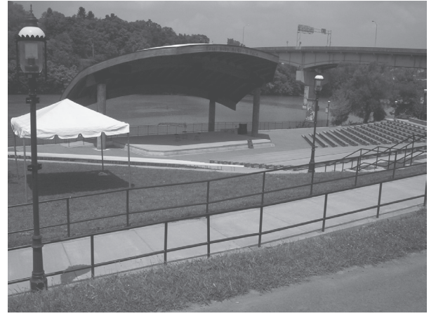
Example of Comparable Waterfront Amphitheater Space