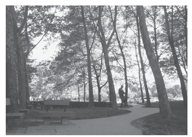
Comparable Civic Park and Open Space

Water Street, can provide easy access to both ends of the proposed trail. All site development and improvements will have to be closely coordinated with the Army Corps of Engineers. The proposed site improvements should follow green building principles and include permeable parking surfaces, stormwater retention and remediation, and lighting compliance with the Dark Sky Initiative.