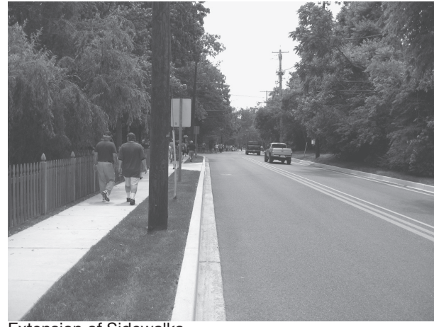
Extension of Sidewalks