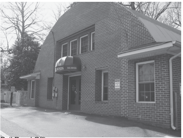
Bail Bond Offices