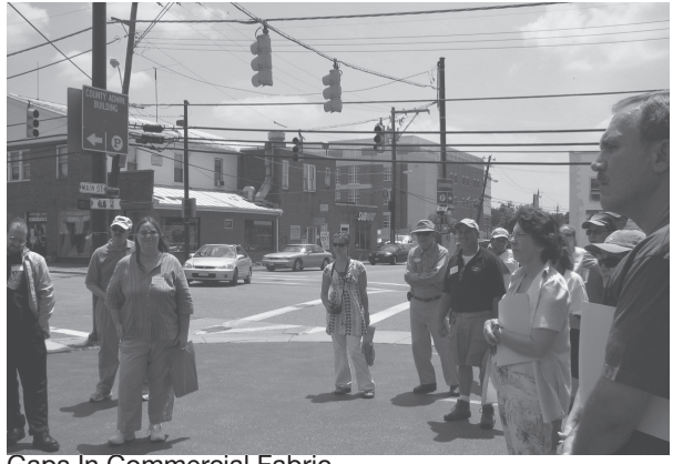
Gaps In Commercial Fabric