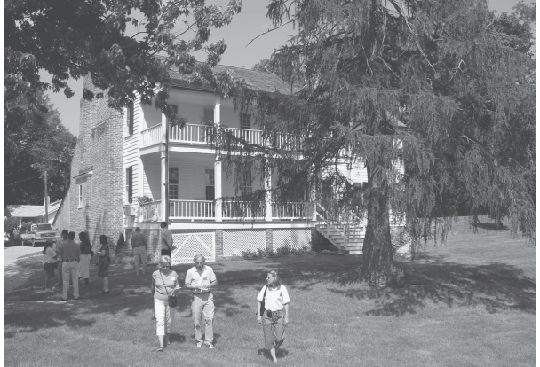
Inventory of Historic Homes