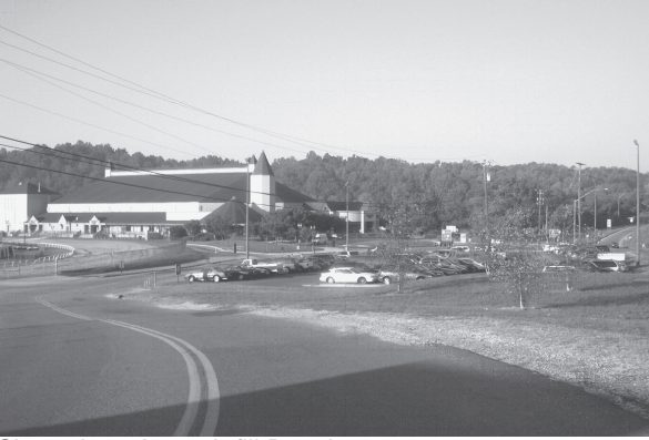
Showplace Arena Infill Development