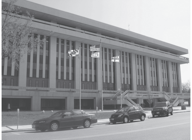
County Overshadows Town