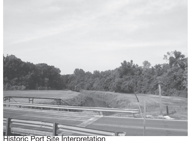
Historic Port Site Interpretation