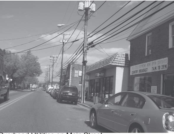
Overhead Utilities on Main Street